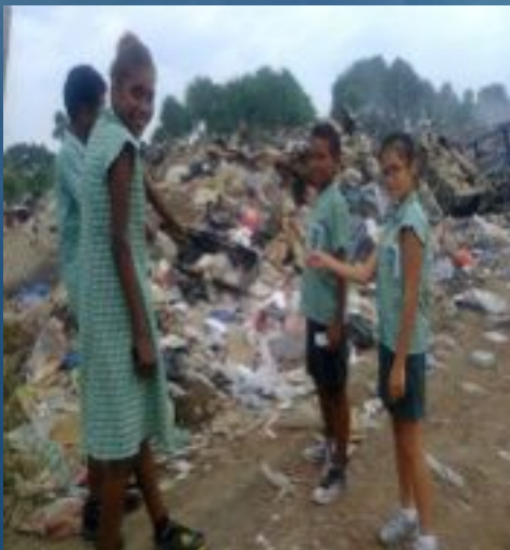
Land pollution group on excursion

If you walk into any of the two Year 5 classrooms, you will see them working tirelessly in their classrooms with their teachers. At this stage, they are sorting out their information and trying to complete the written components of the exhibition.