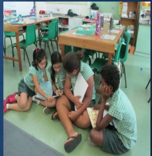
Group discussion and planning