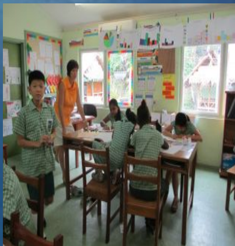
A little guidance from the teacher