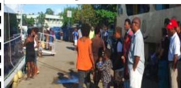
Anxious – or is that excited – parents farewelling their children