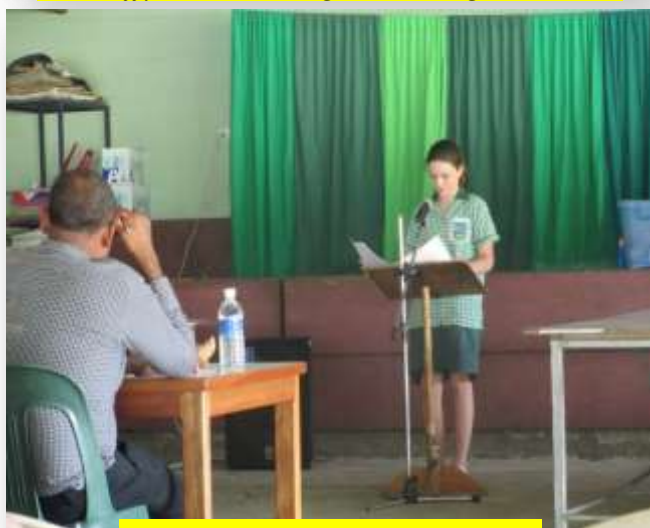
A speaker for the opposition side