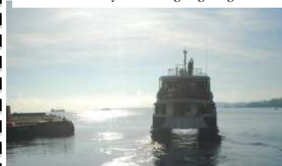
Setting off to Tulagi